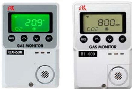
Model : OX-600

Model: OX-600 (O 2 Monitor) Model:RI-600 ( CO 2 monitor)