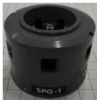
Splash guard Model:SGP-1 (Applied for SD-1RI)

It can also be used in splashing places by applying a splash guard (option)