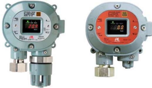
Model : SD-10X

Model:SD-10X ( O 2 monitor) Model: SD-1RI (CO 2 Monitor)