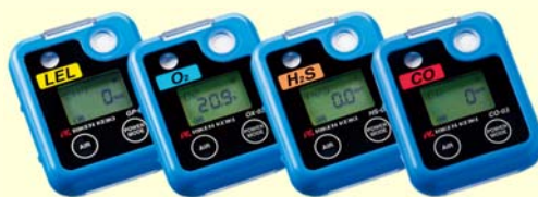
GP-03 (CH 4 or HC) OX-03 (O 2 ) HS-03 (H 2 S) CO-03 (CO)